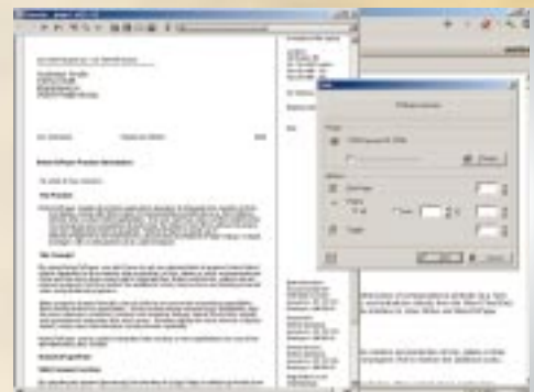
A simple mouse click creates a report.